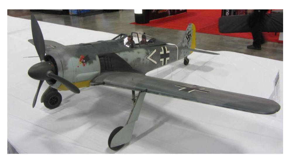
First Place "People's Choice" and Second Place "Designer Scale" - FW 190 A-3 JEFFERY FISCUS