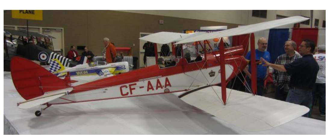
Best in Show & First in Designer Scale DH 60G GIPSY MOTH PHILIP SODEN