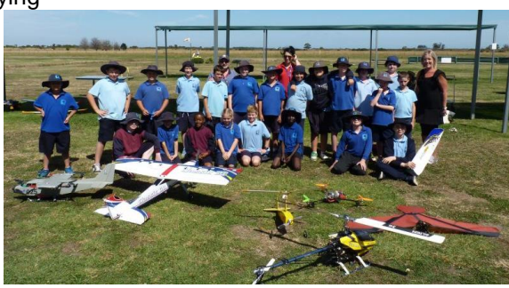
The March 11th School group photo'

At the last training session, other members became involved with providing flying experience for the Students, with glider / F3A / and general flying