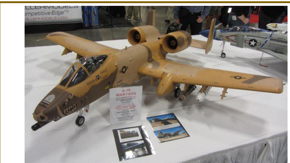
First Place "Jet Plane " - A10 WARTHOG TERRY NITCH