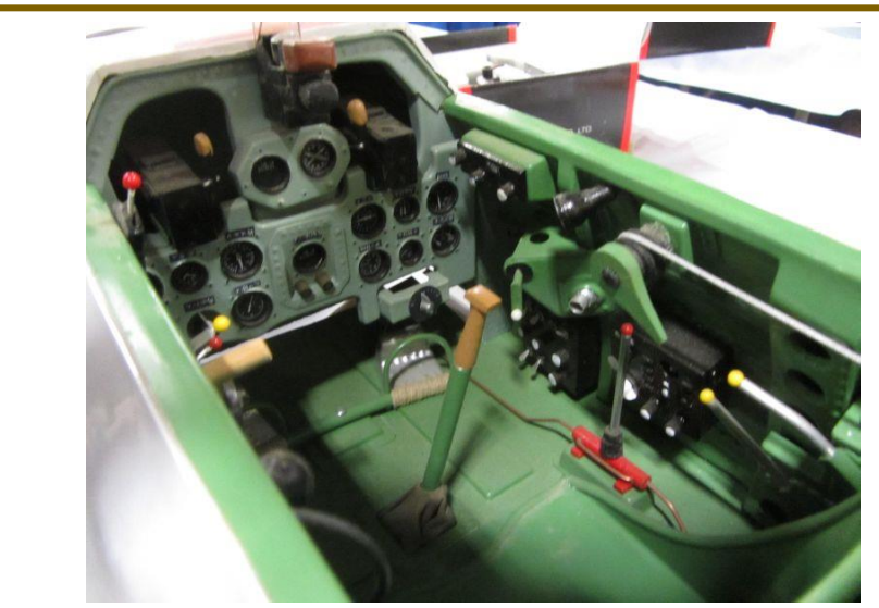
Do you want a cockpit for you next scale model? One of the many available