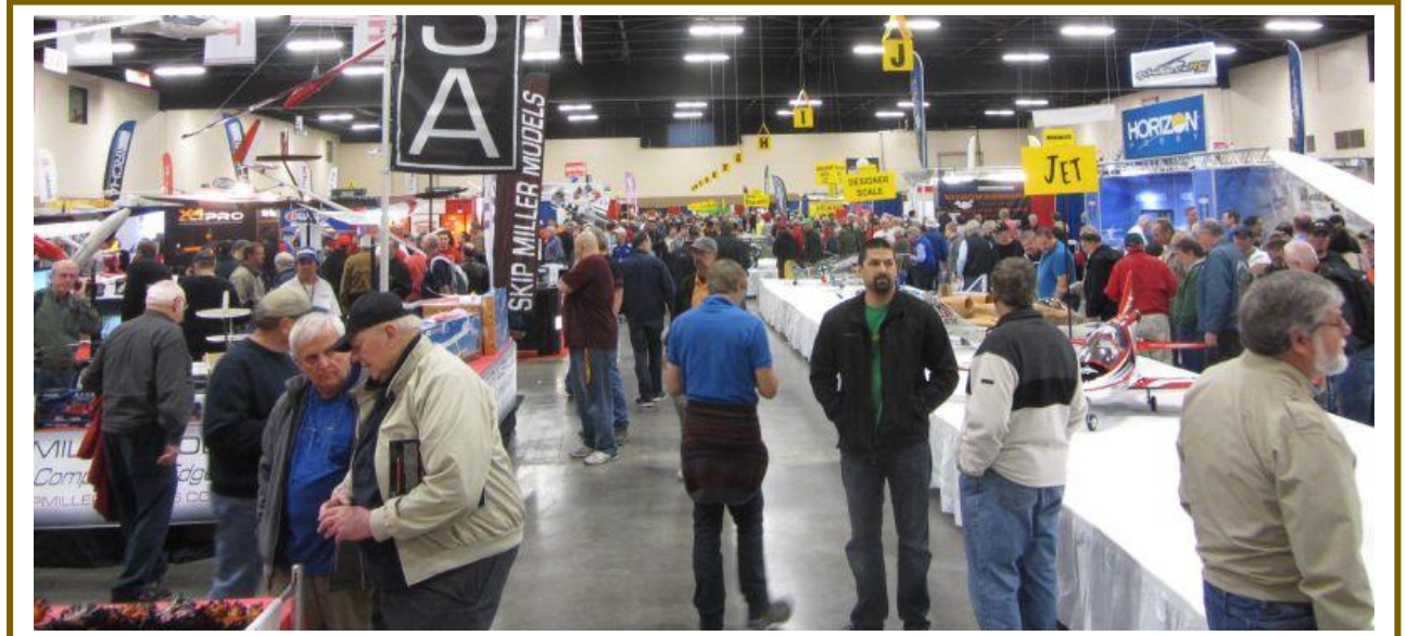
The main display hall