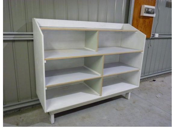
Our Cabinetmaker Mel' Norton modified the old Tx Pound shelves to be used for general storage, good job Mel'