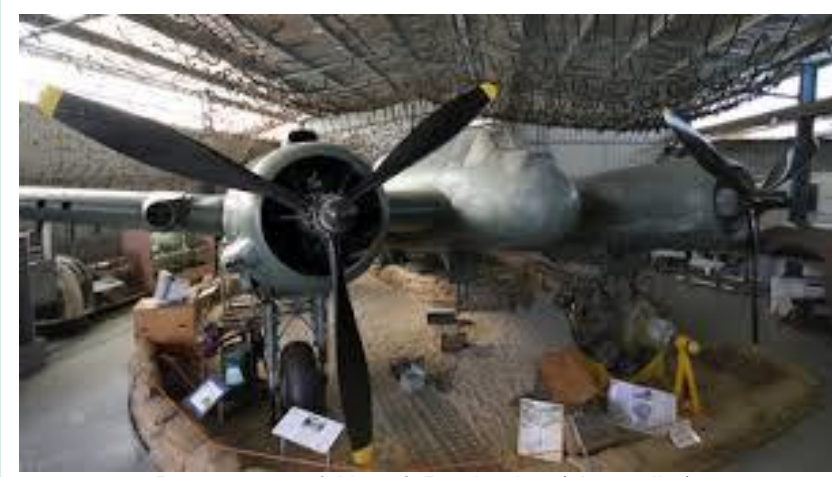
Department of Aircraft Production (Australia) MK21 Beaufighter Australian National Aviation Museum at Moorabbin Airport

It is essential that you book in. Please do so at: <a href="http://pdarcs.com.au/booknow">http://pdarcs.com.au/booknow</a>