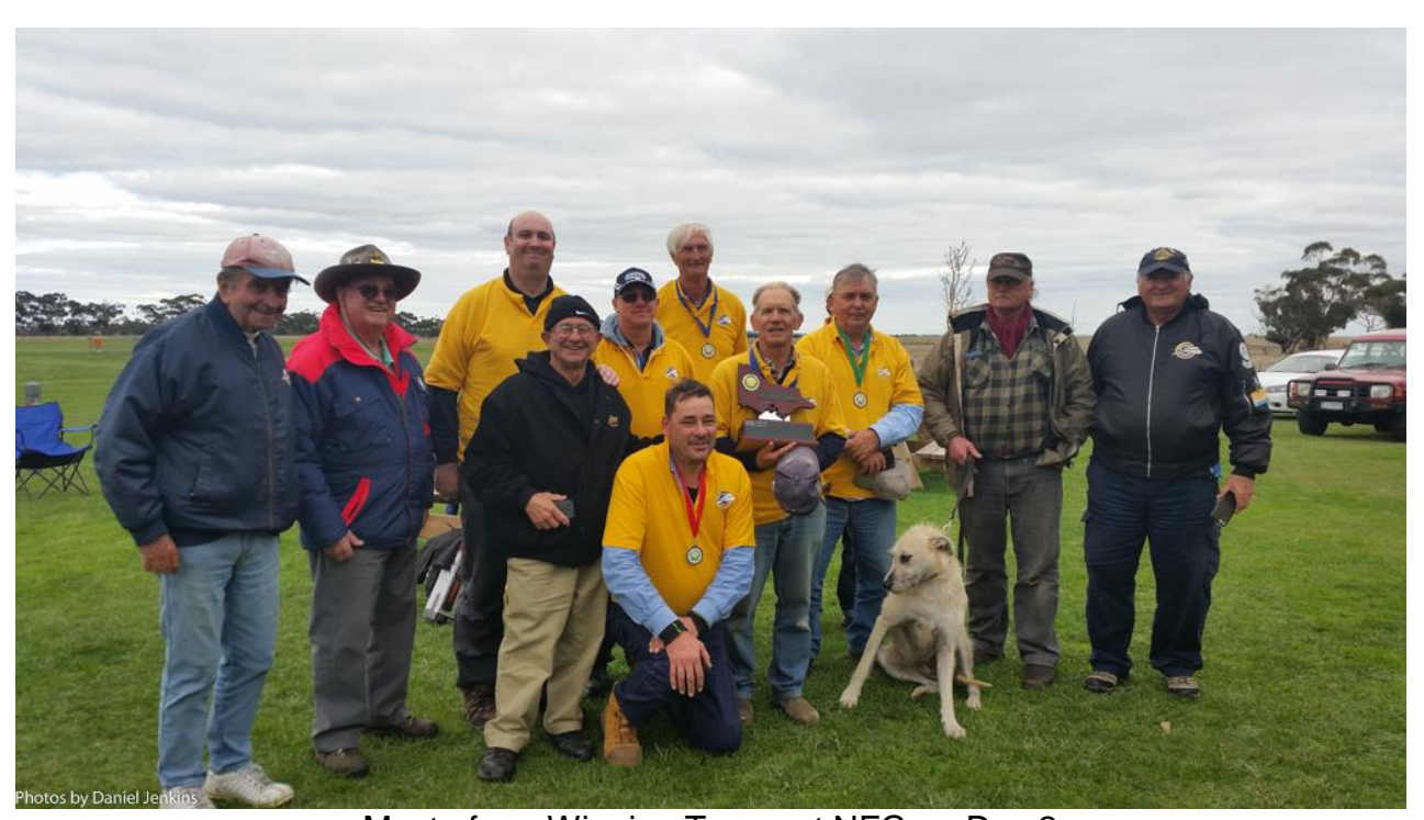
Most of our Winning Team, at NFG on Day 2

Next Club meeting, Sunday 4<sup>th</sup> June At the Burley Field, 1-00pm start