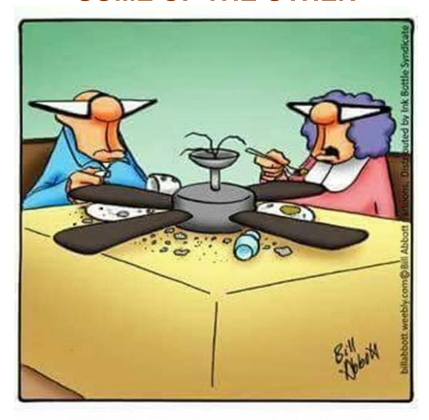
"What else did you fix today?"