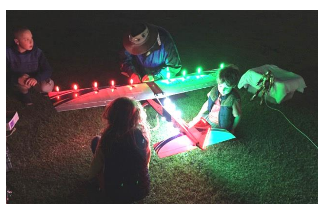
Nice photo' of three children and Frank's nite' flyer, ( Dark Vader ) Iron Man waiting off to the right, Frank at the front

The model met it's end later in the nite, barrel rolled out of control, Iron man injured, required double leg transplant below the knee, a new Dark Vader almost finished