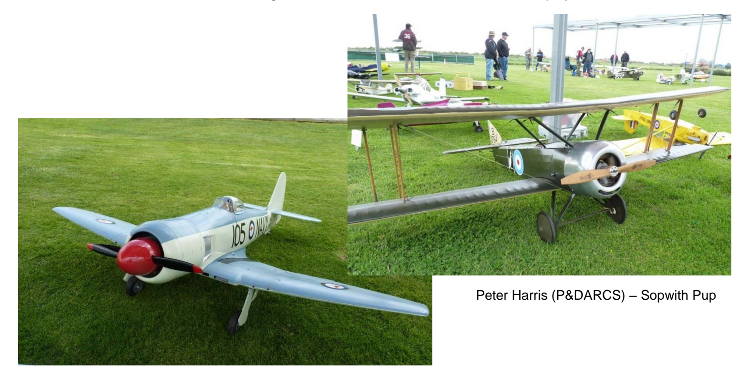
Brian Hutchinson (Bairnsdale) Sea Fury - It has folding wings