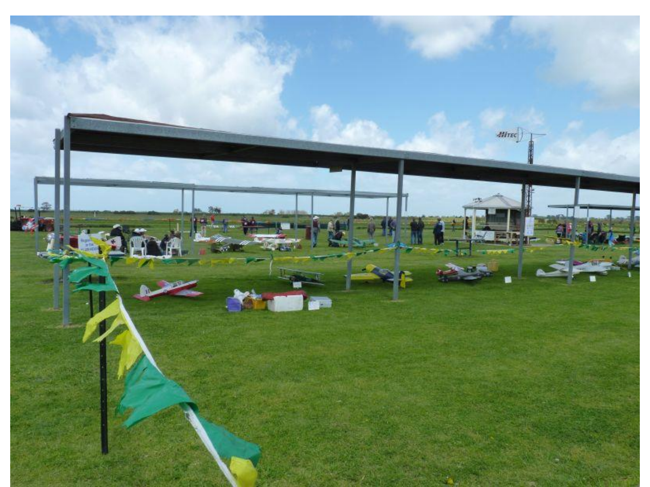
Bunting flapping in the breeze on the P&DARCS Inaugural Kit & Scratch Built Scale Rally