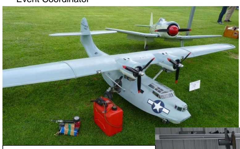
Pilots Choice – Best Aircraft Catalina 1:8 scale - Brian Hutchinson's Bairnsdale Club