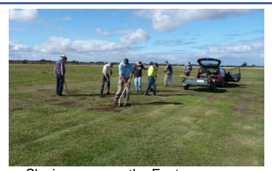
Slaving away on the Eastern runway

Around 20 Members arrived, and made short work of the task, the Club Cook provided sausages in bread for lunch, and there was a General Club Meeting in the Clubroom after.