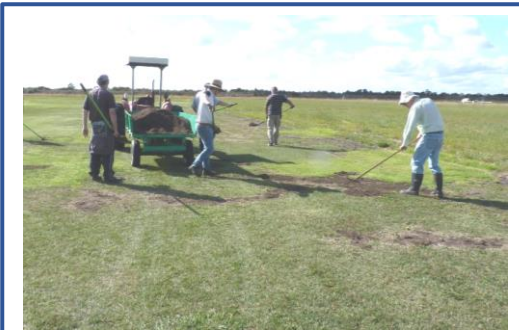
The other crew working on the Main runway