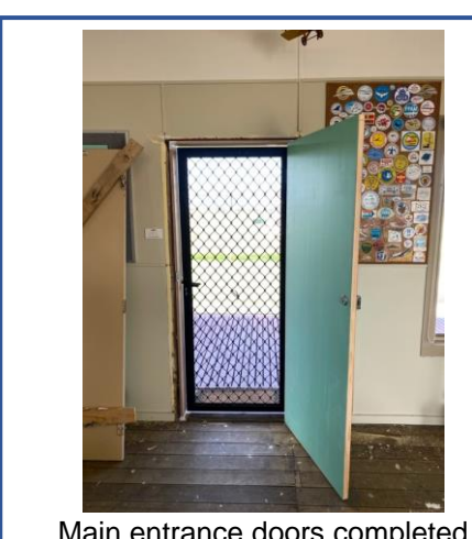
Main entrance doors completed