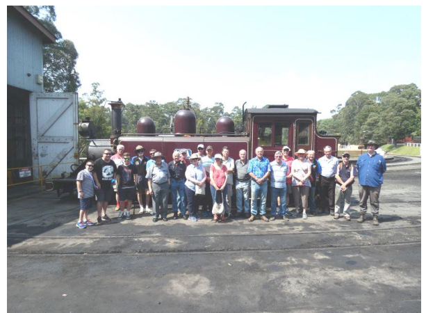
Our visiting group in front of engine 12A Loco prior to driving to the Menzies Creek Museum and BBQ lunch