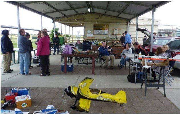
People arriving and having a chat