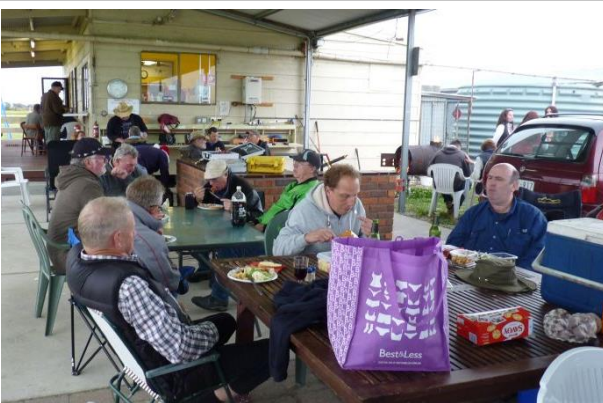
Dinner time, outdoors