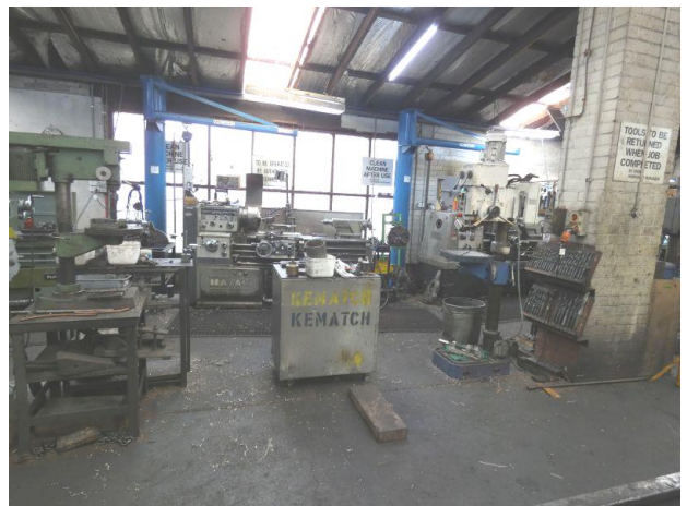
Workshop machining equipment