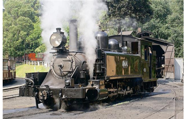
One of the engines in steam at the workshops yard An oil fired 14A loco