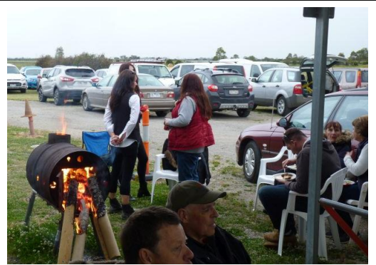
Keeping warm beside the burner