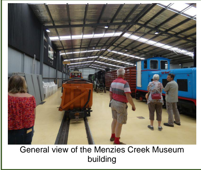
General view of the Menzies Creek Museum building