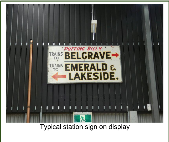
Typical station sign on display