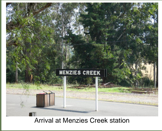
Arrival at Menzies Creek station