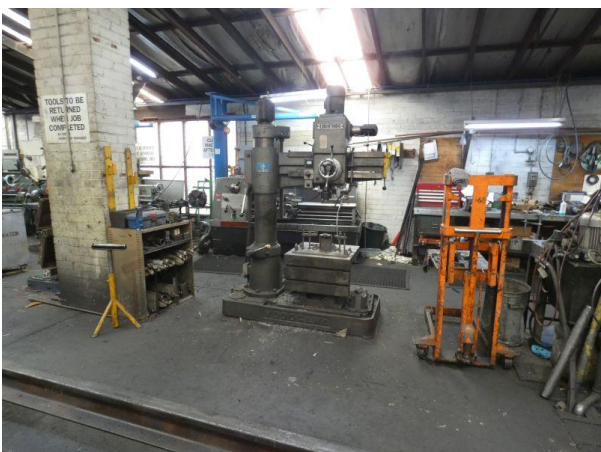
Large swinging arm vertical drilling press