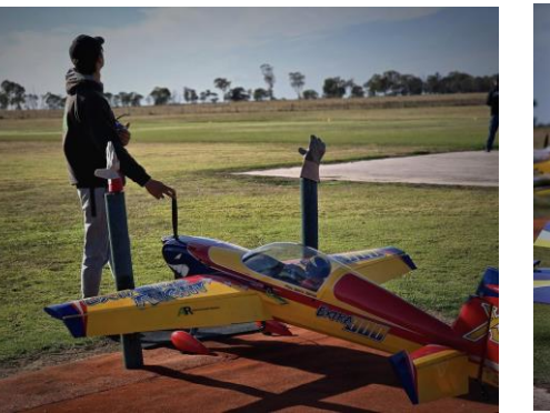
Balint Banko's Extra 300