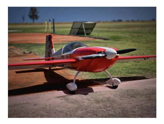
Darcy Wilson's Krill Extra 330 lx