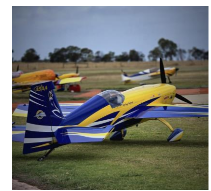
Simon Ventevogel's Extra 330 sc