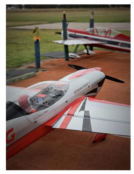
Harrison Ritter's Extra NG