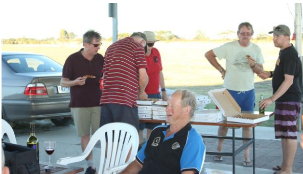
Enjoying Friday night's Pizza's