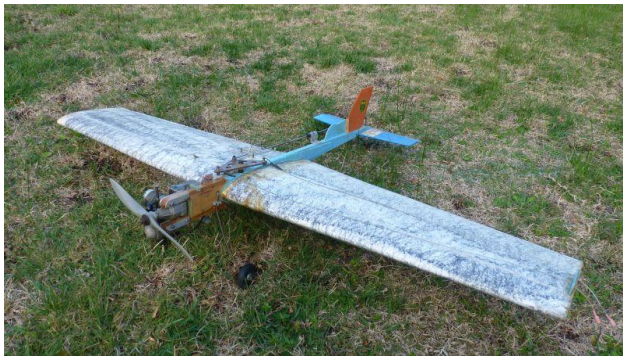
"Uki" stick trainer, old O.S 35, strap on muffler, motor gummed up solid