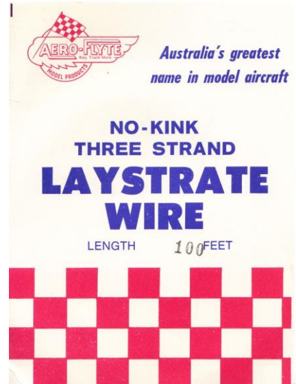
Popular control line wire, cost, 1980s $ 1-20.