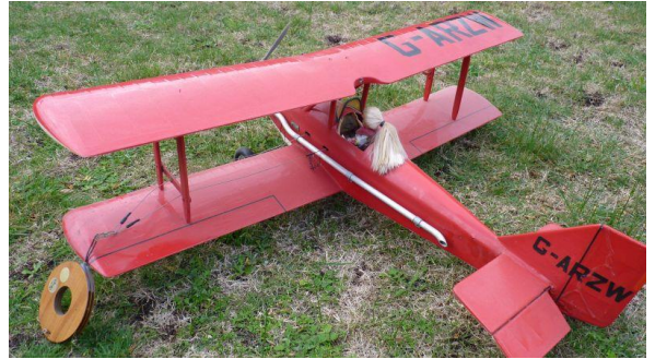
"Wot" from the rear, note there is only elevator control, ailerons are an image, rudder is offset to provide line tension