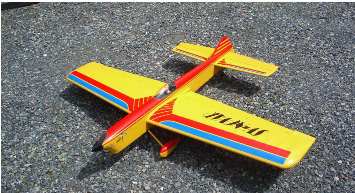
Another stunt model, built by the late Doug Grinham, stalker 61, wing flaps and elevator, Inside wing, ( the port wing ), is longer than the outside wing, providing line tension, residing in NSW ?