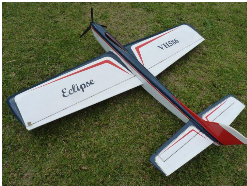
A typical stunt model, built by Doug' Harlow, Moki 51, 3 bladed prop', adjustable rate of travel on wing flaps, inside wing ( the port wing ) is longer than the outside wing providing line tension, note Doug's early VMAA reg', currently in Frank Mack's hanger