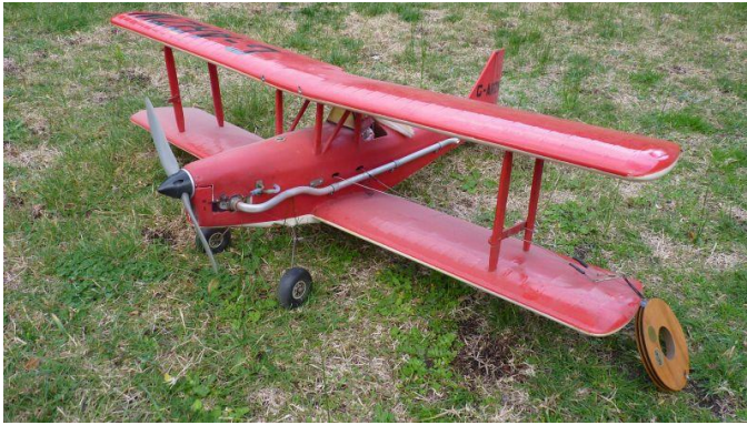
Little red biplane, model of a 1940s "Currie Wot" 46 LA, extended exhaust, control lines storage roll sitting on inside wing