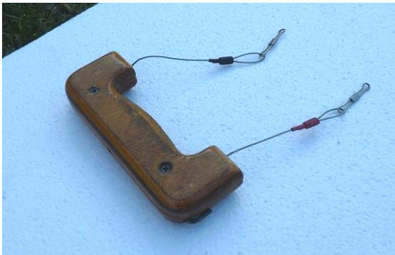
A typical adjustable control handle