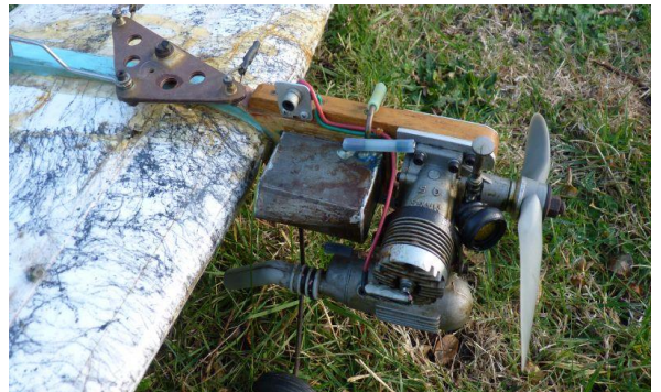
"Uki" motor / tank / bellcrank detail