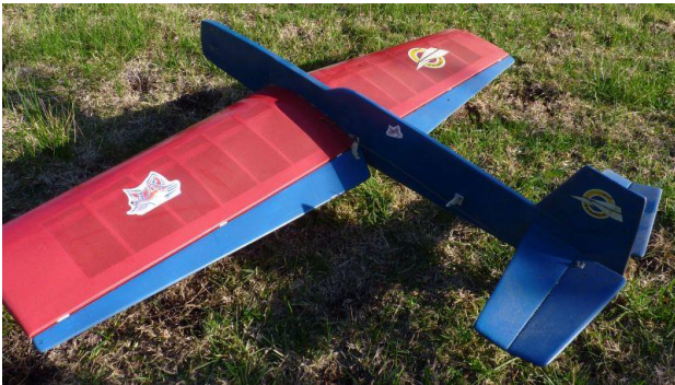
Another stick trainer, think Wally S donated it