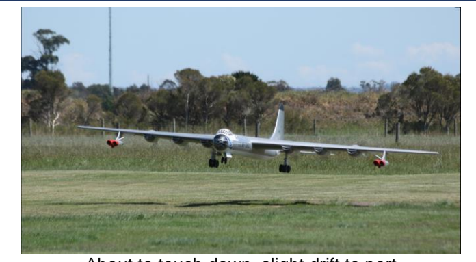
About to touch down, slight drift to port