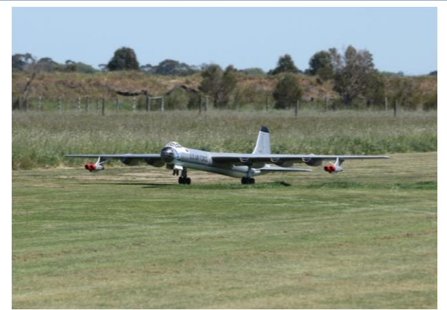
Take off run, the B36 has rotated, on the rear mains, all systems are go, ready for lift off