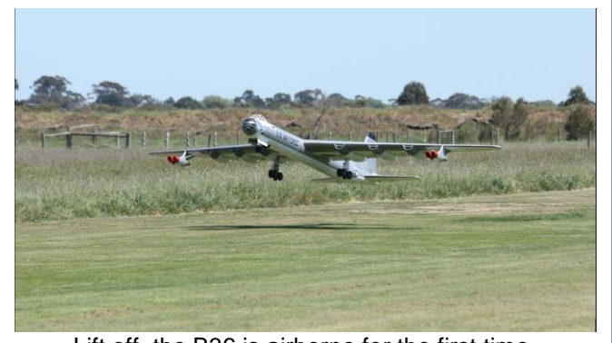
Lift off, the B36 is airborne for the first time, What an awesome sight