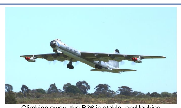
Climbing away, the B36 is stable, and looking magnificent in the air