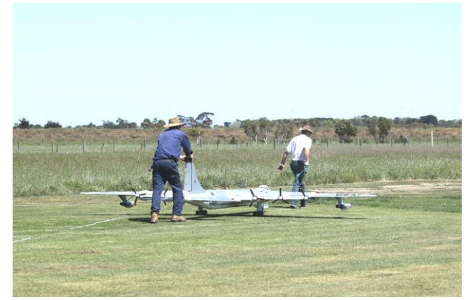
Paul Somerville and Andrew Smallridge moving the B36 to the Western end of the main runway, as battery consumption was unknown at this stage, it was decided to avoid taxiing, to conserve power