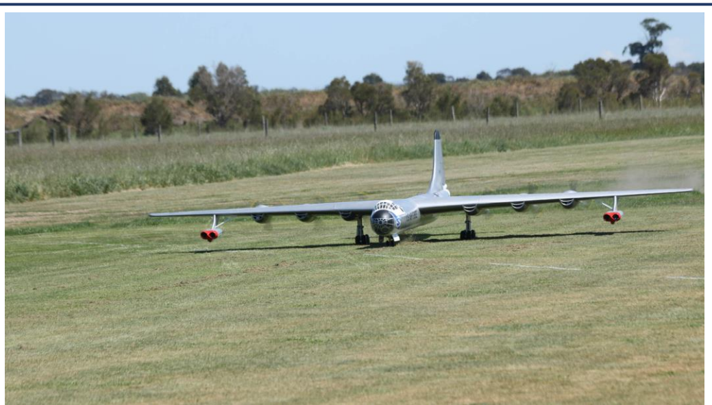
On landing roll – out, a perfectly controlled landing, conclusion to the first test flight Much merriment and back slapping, by all involved