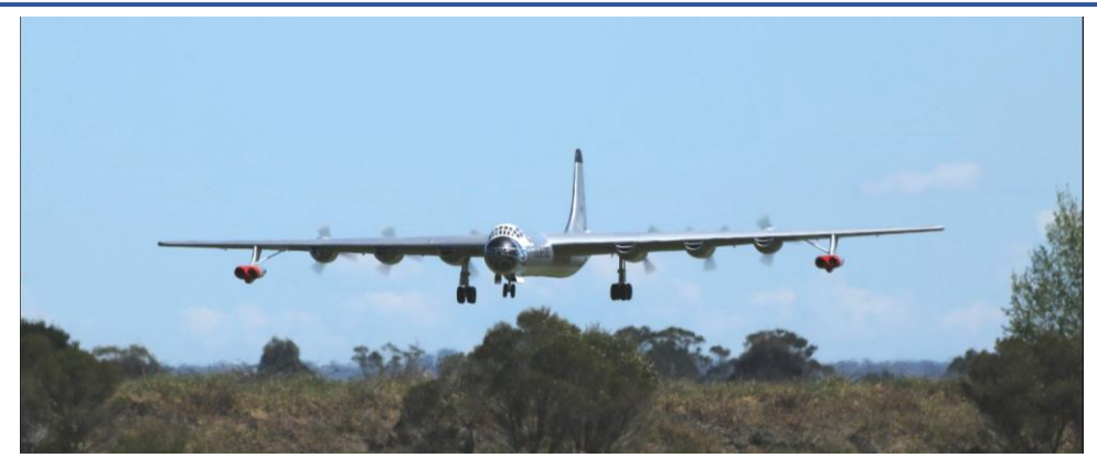
Out over the western bank on final approach to the main runway