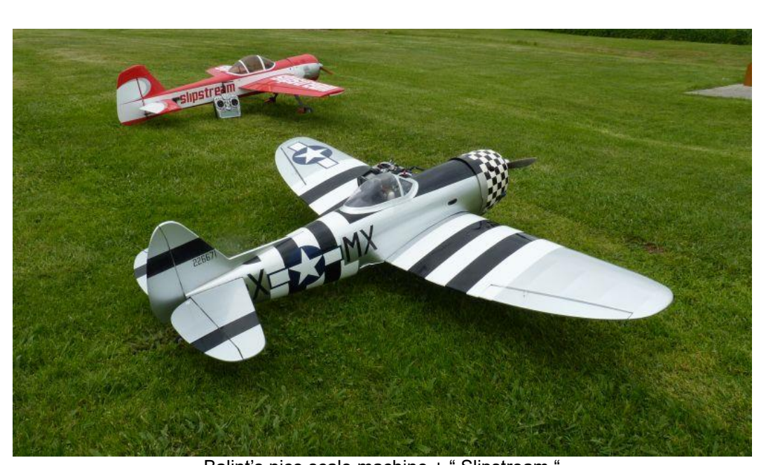
Balint's nice scale machine + " Slipstream "