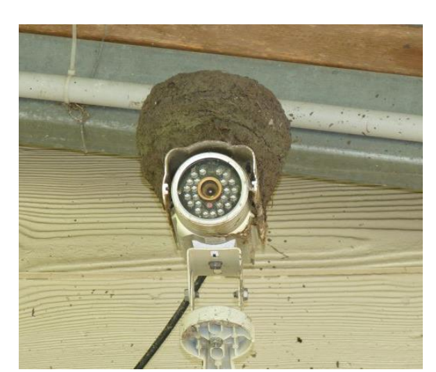
Our hayshed camera has a " hat " compliments of our local birdlife