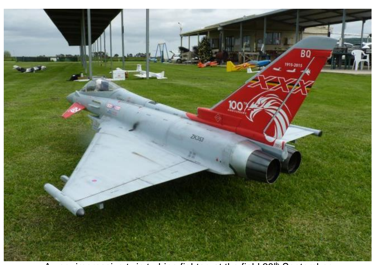
A very impressive twin turbine fighter, at the field 28th September

Next Club Meeting, Saturday 2<sup>nd</sup> November 2019 At Burley Field, 1pm start