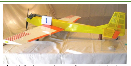
No. 1 — Hullo, I am an intermediate acrobatic plane and my name is Southern Eagle (from an RCM plan) with 63" wingspan and is the fourth one my "Boss" has made, but I do not have a canopy or turtle deck like the others, to make me lighter. I have an OS 61 2 stroke up front. YET TO BE FLOWN and I cannot wait for my first flight

None are "show ponies"; they are all "weekend warriors" for general fun flying. Note that they all have engines / motors and servos, BUT will need receivers and batteries (3S lipos in gliders) and rebalancing