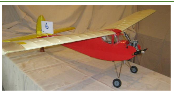
No. 6 – Greetings, I am a Tomboy (at 150% size), with 66" wingspan, and I am a famous design from November 1950 issue of English Aeromodeller magazine, originally a free-flight model, but now, with a worldwide re-interest in this model in recent years we are now powered and R/C. I am a lovely floating around type model, but can sometimes be a bit squirrelly taking off, but this only adds to the fun and hones your skills. A lovely OS 20 4 stroke serves me perfectly.

Some people may say my tail plane may be a bit small but I have an adjustable tail plane for incidence adjustment to suit your style and needs. My Boss" has flown me many times and is sorry to let me go. Oh. By the way, an OS 52 4 stroke (inverted) is doing it's thing up front.