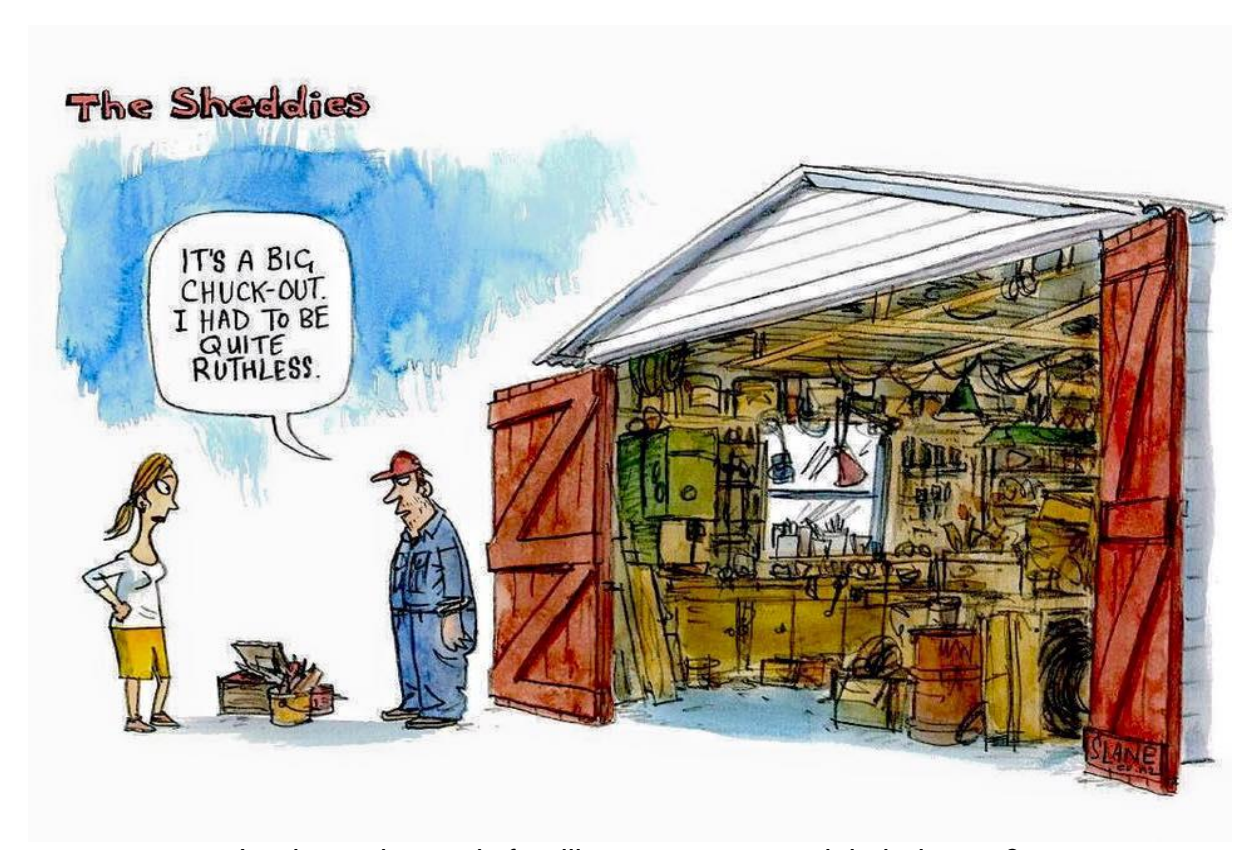
Looks and sounds familiar, too many model airplanes?