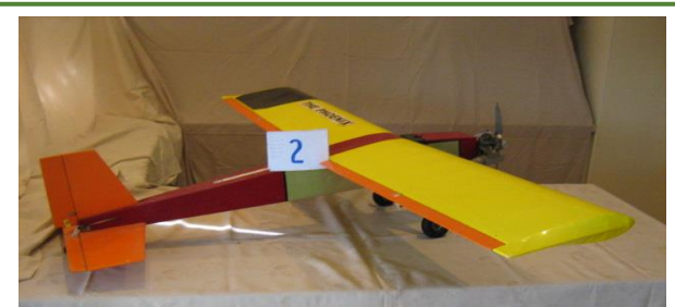
No. 2 – Hullo – I'm an acrobatic learner Fun Fly 40/60 with a 69" wingspan. I fly very well but after some incidents proving I am hard to kill, I have been renamed "The Pheonix" for my many reincarnations. I have made my "Boss" very happy and more skilful and have had many flights with him. I have an OS 40 2 stroke to pull me around