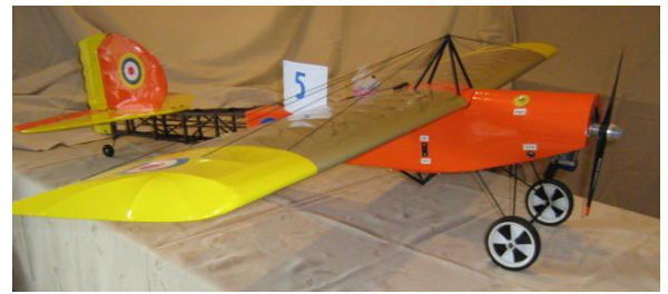
No. 5 – G'day, I'm an Elder 40 (Great Planes) semivintage with an open frame fuselage and a 65" wingspan I also have remote "glow" and refueling points.

Some people may say my tail plane may be a bit small but I have an adjustable tail plane for incidence adjustment to suit your style and needs. My Boss" has flown me many times and is sorry to let me go. Oh. By the way, an OS 52 4 stroke (inverted) is doing it's thing up front.