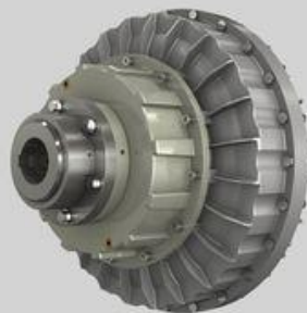
Constant Speed coupling