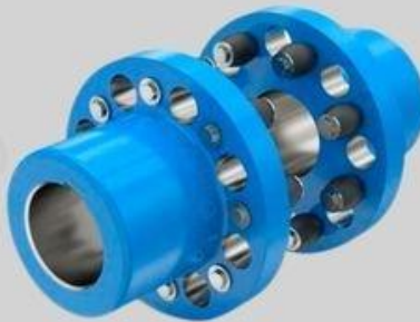
Bush Pin Coupling