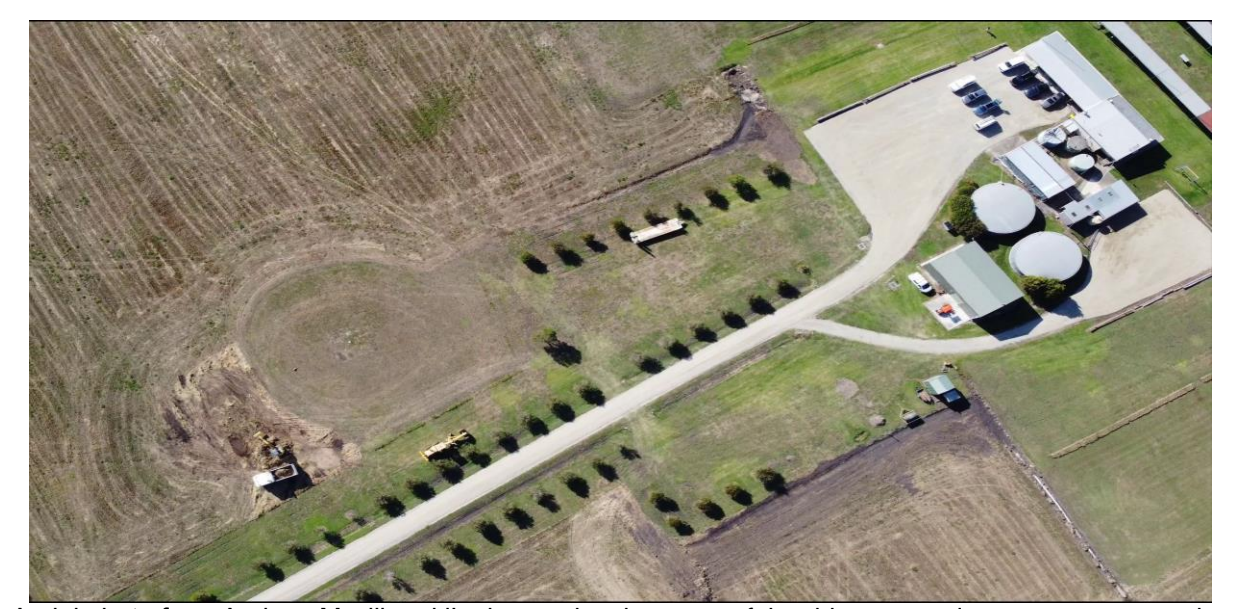
Aerial photo from Andrew Mysliborski's drone, showing most of the driveway and our two new carparks, on the left is the Contractor clearing the piles if soil from beside the Control Line Circle. The dark lines in the paddocks, are tracks leftover from the hay cutting contractor.