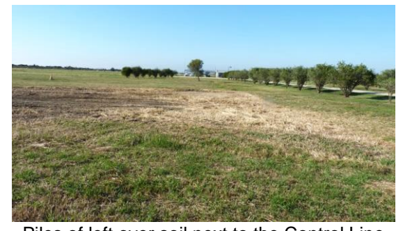
Piles of left over soil next to the Control Line Circle has been removed, new grass growth will establish.