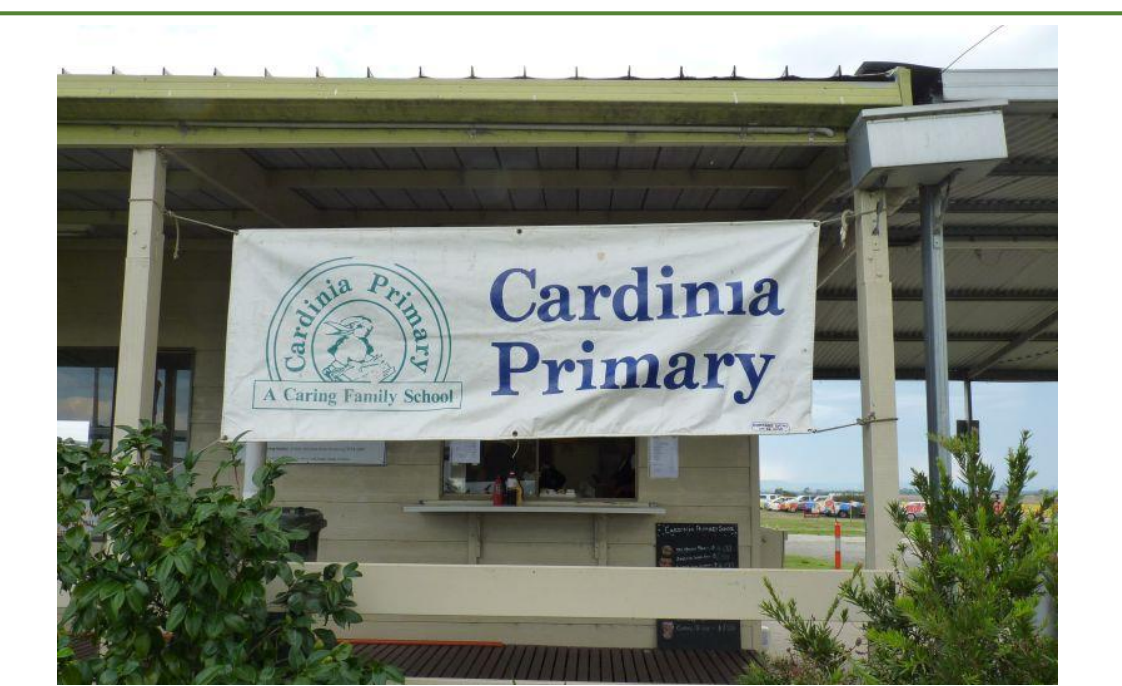
Cardinia Primary School, provided catering for our March 2013 Monty' Event, plus lots of others,