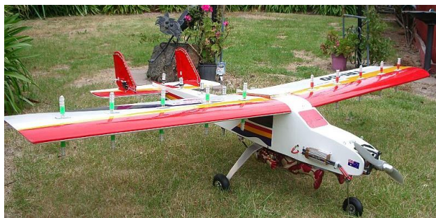
The LED lights are called corn cobs

The replacement Dark Vader 2, is shown below, Ironman is held under the fus' ready to be dropped via parachute, he was only slightly injured in the crash