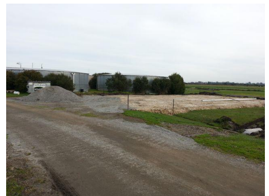
The shed site as at 23 rd October

Earth works require final leveling, and compacting, and it is envisaged we will be able to start construction when the warmer dry weather arrives