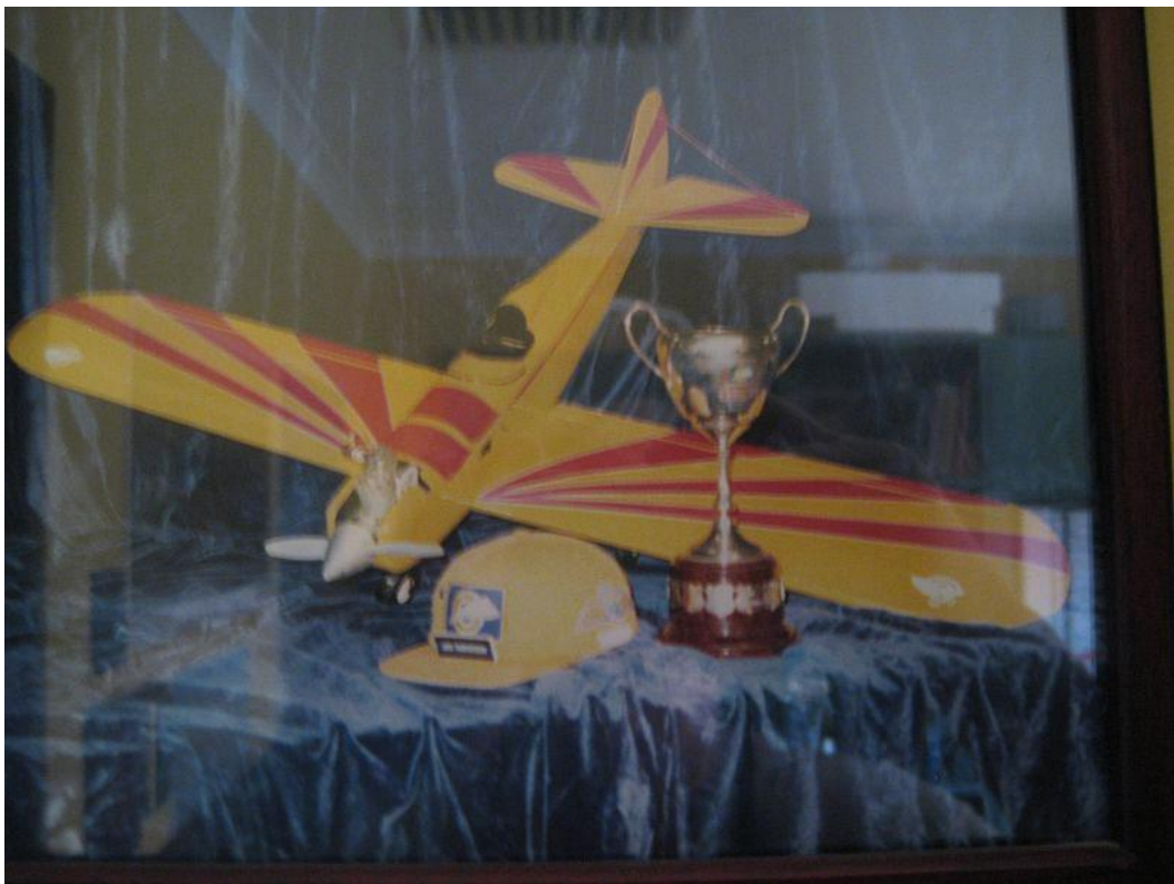
The Trophy sitting beside a Club Cap and a Comp' model