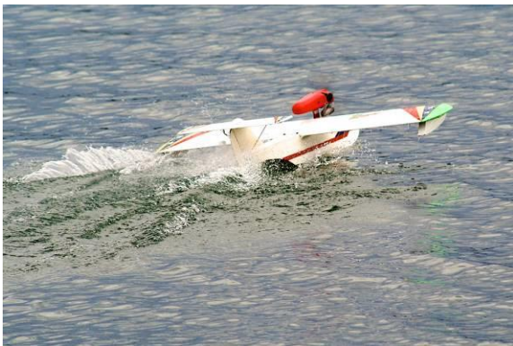
Bill R's model ready to lift off ?