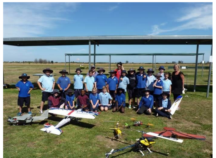
All students + Teaching Staff, prior to departure