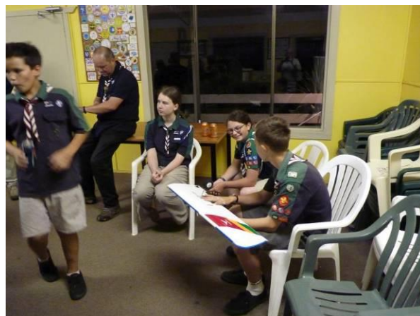
Spoils of the crashed Scanner, a wing