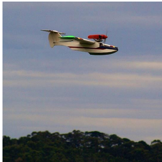
Bill's model in action