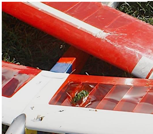
Eagle damage, ouch !