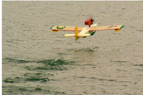
Peter H's model just after lift off