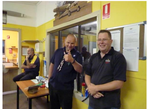
Two of the Scout Leaders