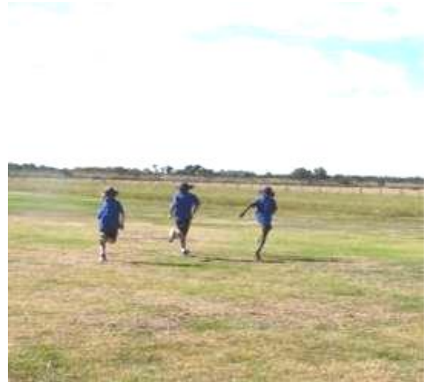
Parachute recovery team heading out