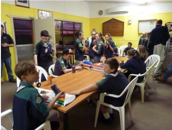
In the Clubhouse for drinks and sausages