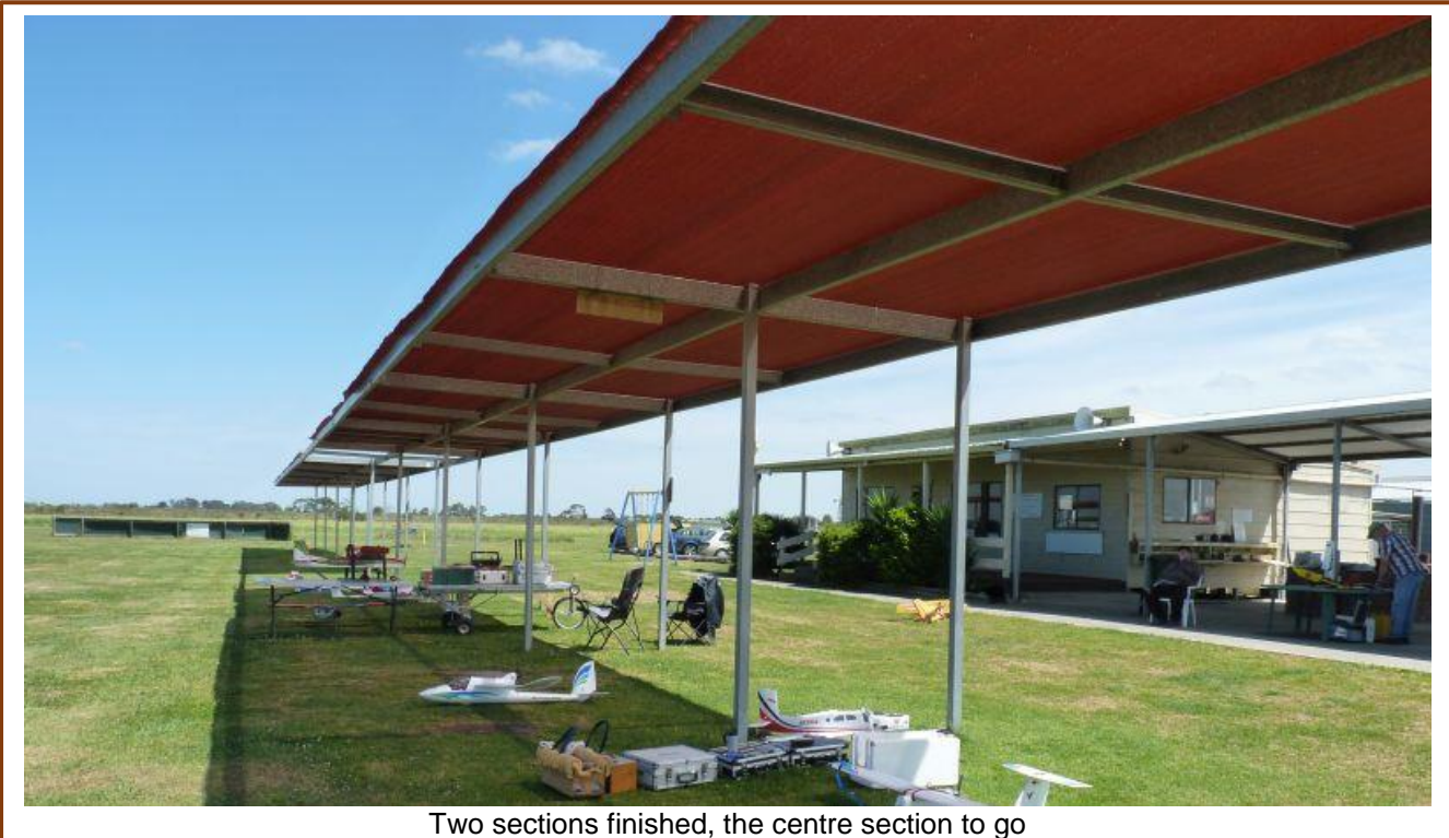
Really good shade, and a modern looking colour