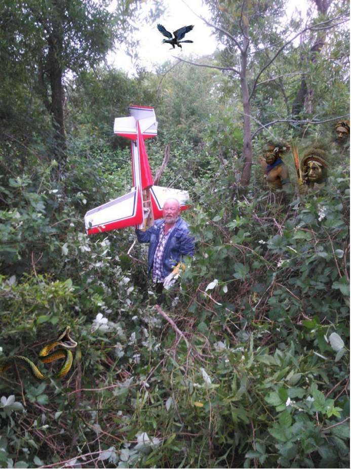
WARS contractor, Andrew Mysliborski shown holding the recovered aircraft, on-site in the Eastern Badlands, a hazardous area