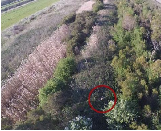
General location of the aircraft, Eastern Badlands, opposite stand of dead cypress trees, at rear of our field