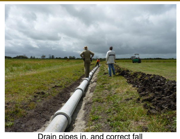
Drain pipes in, and correct fall

Drain scoured, levelled and screenings laid