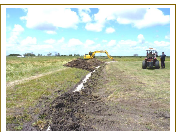
Back filling, the fill being taken from stock piles near Wenn Road