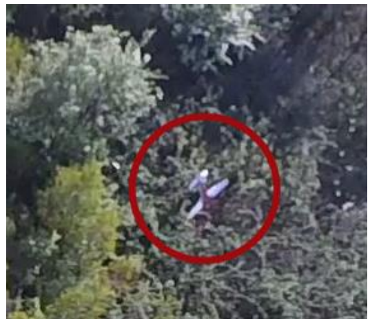
Detail of the aircraft, suspended in foliage