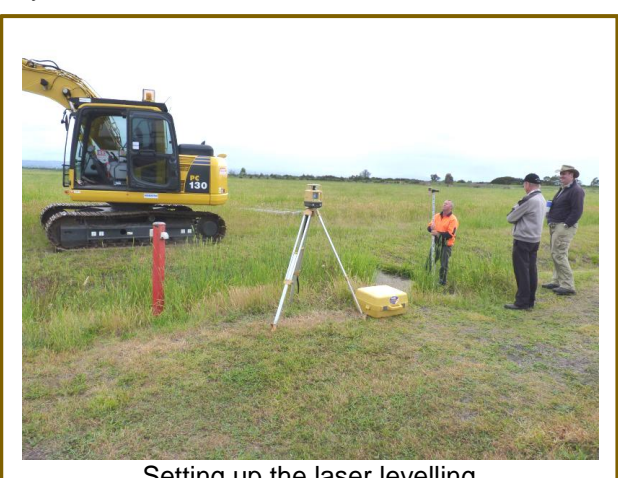
Setting up the laser levelling