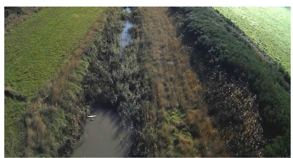
A photo from Andrew's Search and Rescue service, the model is at lower left, in the water of the second channel past the Eastern Badlands, our Flying Field is immediately left, out of view, the model is a trainer, very waterlogged